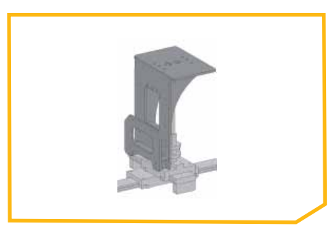
Device positioning system

Accuracy and precision: graduated scale available on each axis. The DUT is fixed with a specific adaptable grip.