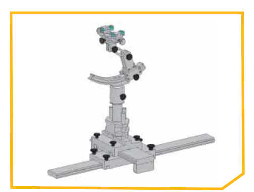
Handset positioning system

This simplifies the positioning of the acoustic output of the telephone on the cross section of the phantom, before rolling the system underneath the phantom. It also improves the accuracy and repeatability of the positioning with a tolerance < 1 mm.