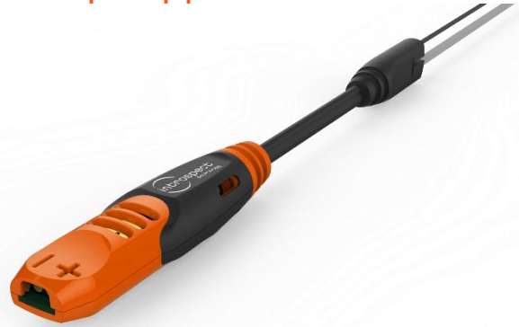
Figure 1 Compact High Impedance Active Probe

The PV1 Active Probe is a signal measurement solution for high speed links carrying low-voltage, high bandwidth signals up to 5 Gbps. By providing a completely non-proprietary instrument interface, it facilitates the attachment of a wide range of instruments to any given device under test while minimizing circuit loading and maintaining signal integrity. Its miniature and light weight probe amplifier can be attached directly to optimized solder-in tips for accessing hard to reach signals.